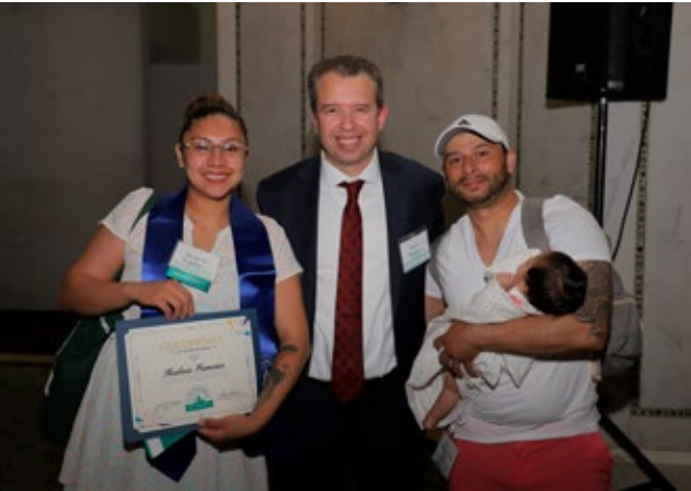
Teach Chicago: Chicago Teacher Residency 2022 Induction

There's no greater return for Chicagoans than investing in our young people. Increased support for CPS and more students and families learning and thriving in Chicago Public Schools is good for our district, and for our city as a whole.