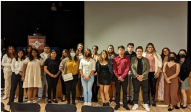
CPS Dream Fund 2022 Scholarship Awardees