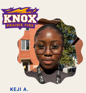
SULLIVAN HIGH SCHOOL